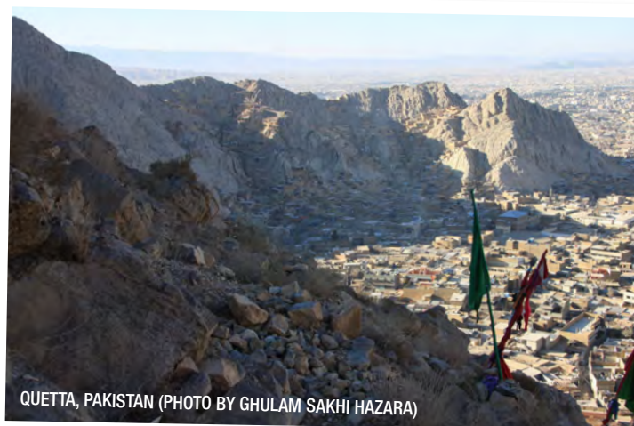
QUETTA, PAKISTAN

Should the treatment of asylum seekers be hidden from citizens and the media, or do we have a right to know how government policies are being implemented in our name? By what criteria can a society be judged to be good? By its wealth? By the way in which it treats its poorest and most disadvantaged? By the richness of its art and culture? Do we have responsibilities to those less fortunate than ourselves? These are a few of the questions this program should encourage students to consider. Mary Meets Mohammad presents a close study of how one small community learns that things are not always as they first appear and that people are not always as inflexible and stereotypical as they are often depicted in the media. Changing attitudes and behaviours are possible.