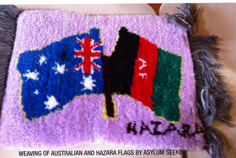
WEAVING OF AUSTRALIAN AND HAZARA FLAGS BY ASYLUM SEEKER

Write three short paragraphs describing Australia's current practices in relation to our treatment of boat arrivals. Paragraph one should be a neutral description, paragraph two from a person who believes the boats should be stopped and paragraph three from someone who believes our treatment of asylum seekers is inhumane. Think carefully about the kind of language each person will use.