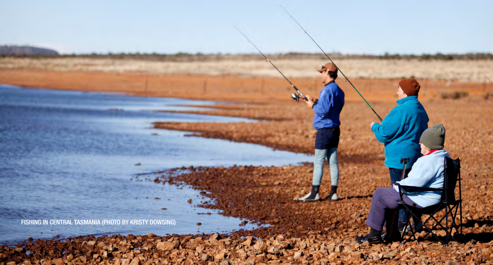
FISHING IN CENTRAL TASMANIA