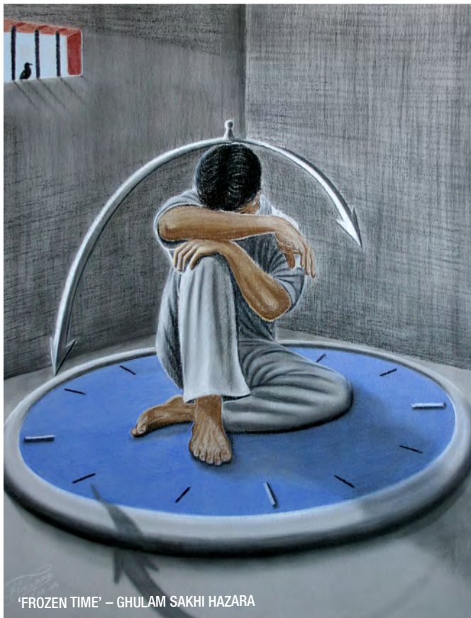
'FROZEN TIME' – GHULAM SAKHI HAZARA