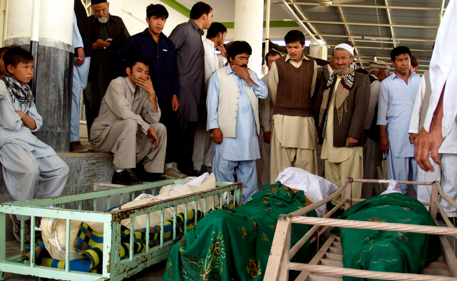
HAZARA COFFINS IN QUETTA, PAKISTAN