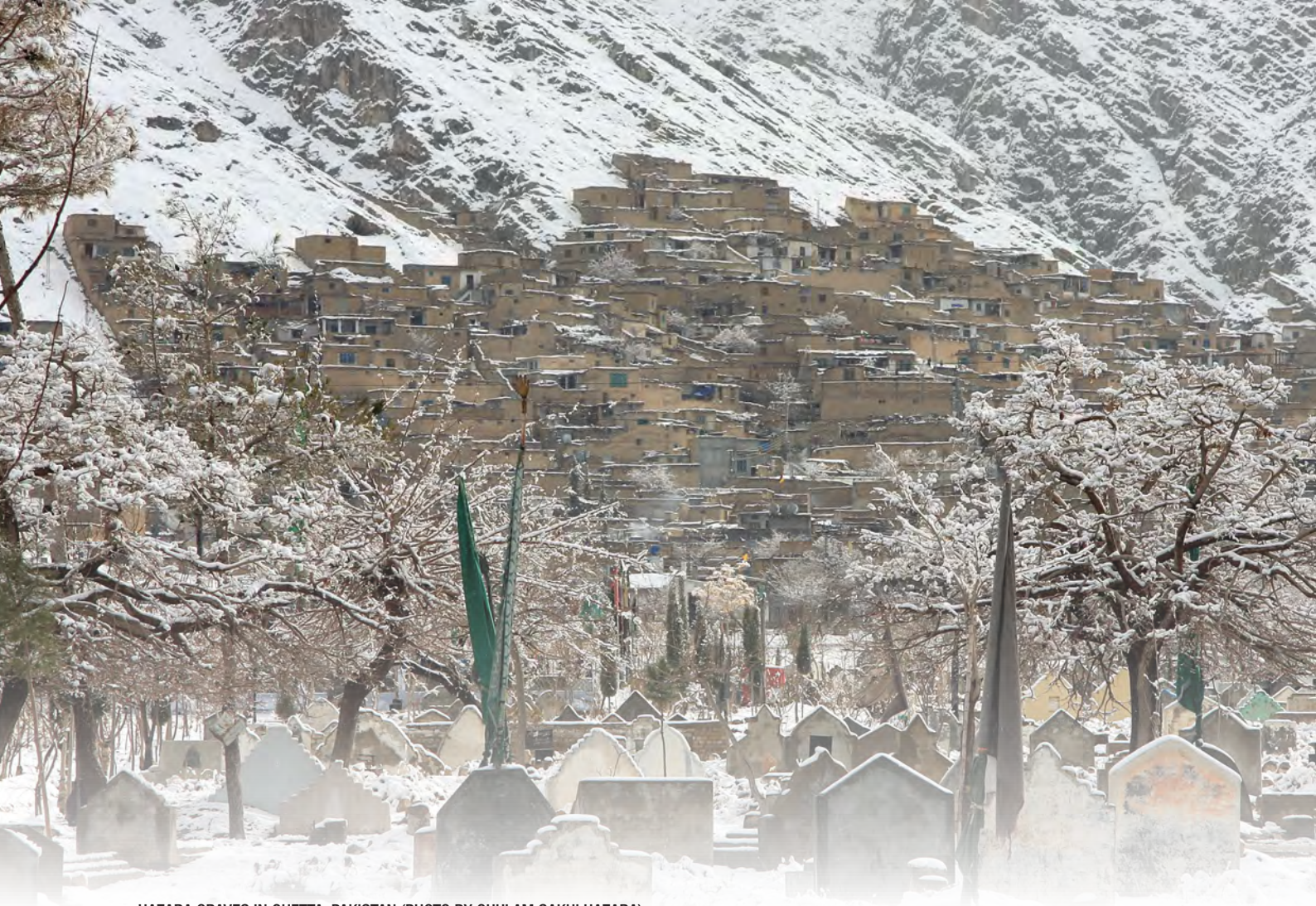
HAZARA GRAVES IN QUETTA, PAKISTAN