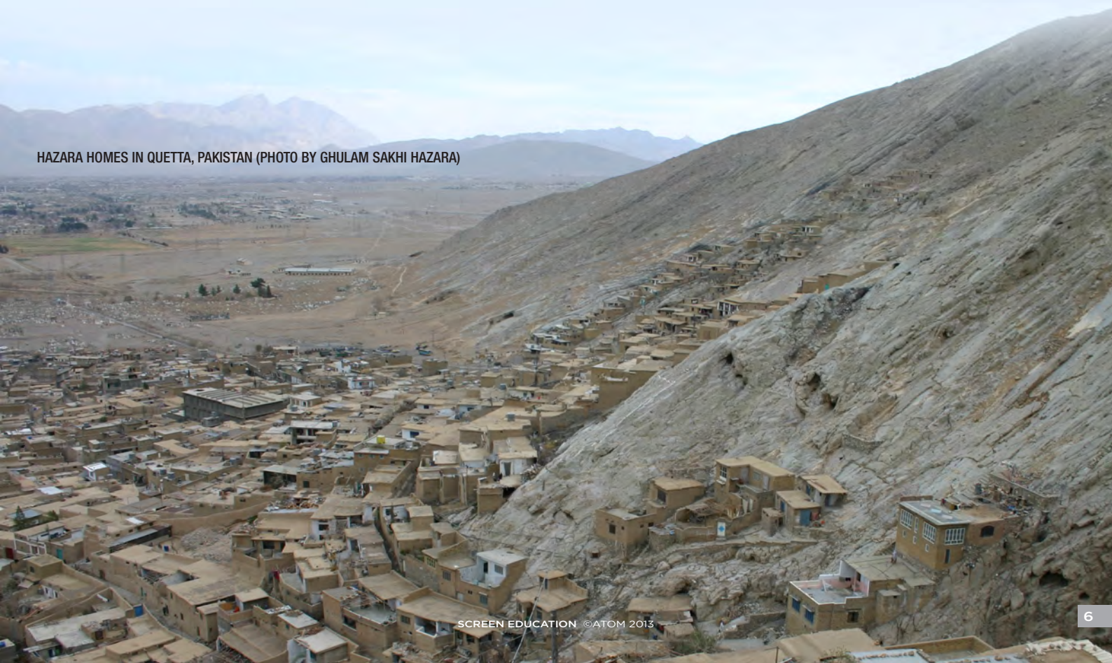
HAZARA HOMES IN QUETTA, PAKISTAN

The Keating Labor government introduced mandatory detention legislation for asylum seekers arriving in Australia without visas in 1992. For a timeline of key decisions and policy changes in relation to indefinite mandatory detention between 1992 and 2012, see a two-part article by academic and journalist Wendy Bacon, published in New Matilda in 2012.