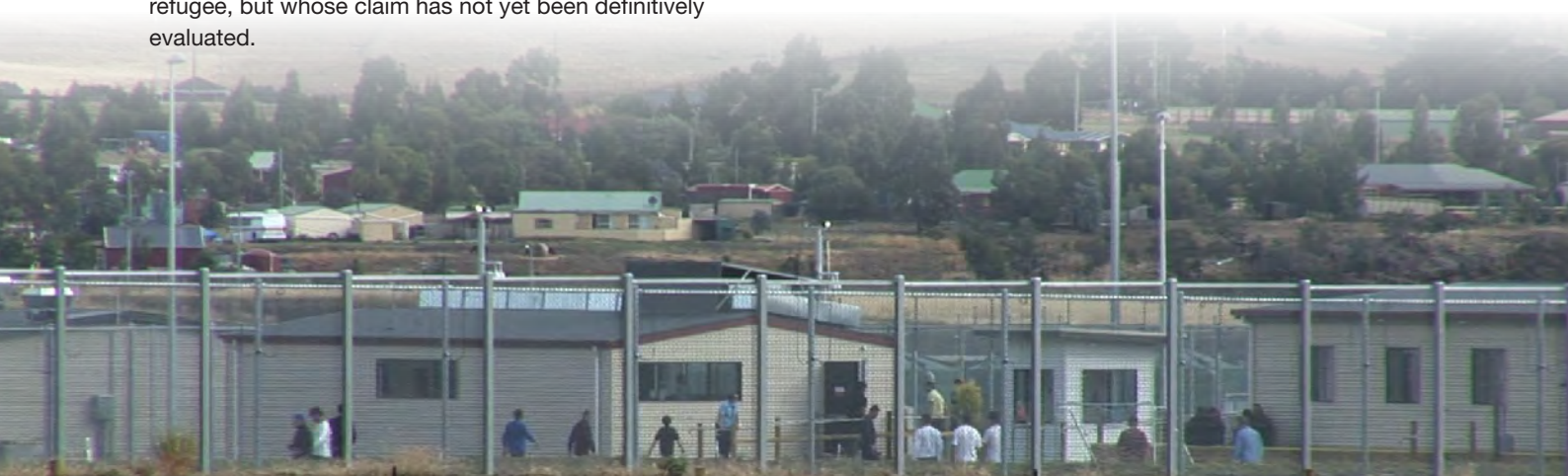
ASYLUM SEEKERS IN PONTVILLE DETENTION CENTRE

A gap continues to widen between richer and poorer countries when it comes to who is hosting refugees. Developing countries host 81 per cent of the world's refugees compared to 70 per cent a decade ago. Pakistan continues to host more refugees than any other nation (1.6 million), followed by Iran (868,200) and Germany (589,700).